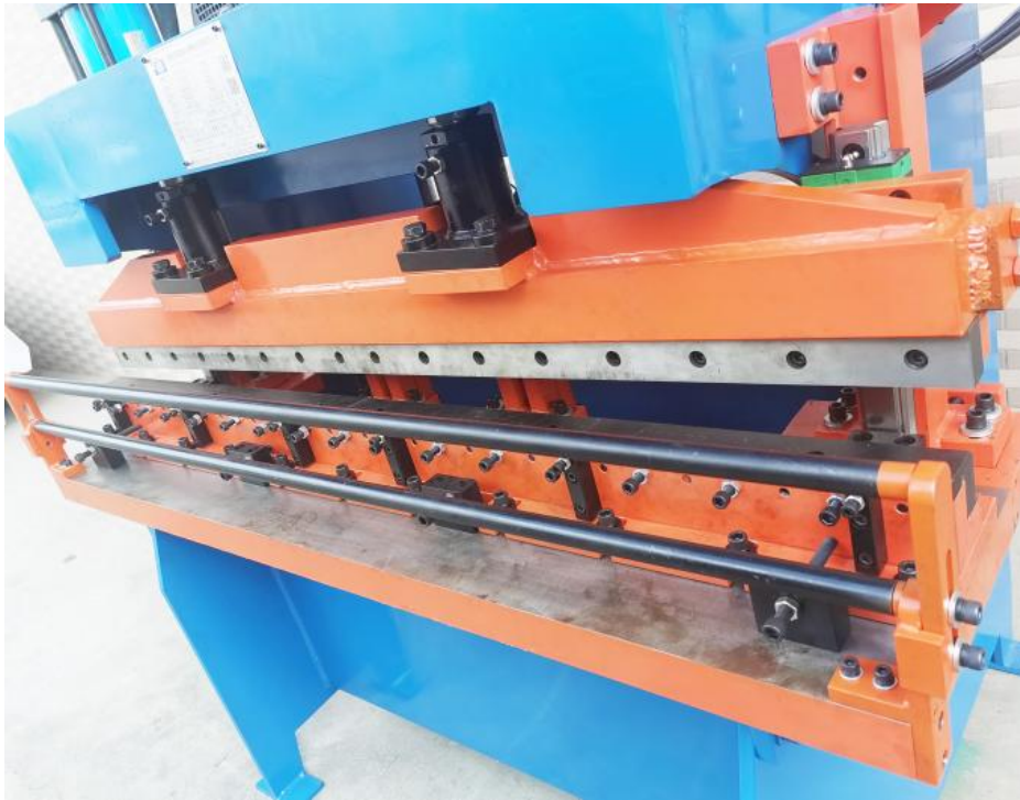
2. The double head is fixed, the large sliding rails on both sides slide, the heavy oil cylinder is adjustable, the whole machine is stable and powerful, and the cutting angle is controllable.