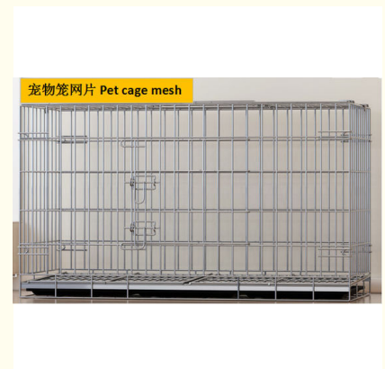
宠物笼网片 Pet cage mesh