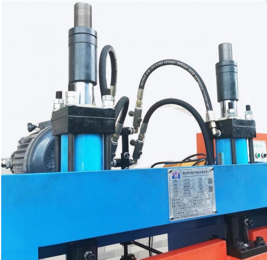
3. Large motor + high-pressure pump + large flow valve provide large power for the whole machine, and the hydraulic cooling pump provides large power for long-term operation without being affected by high temperature.